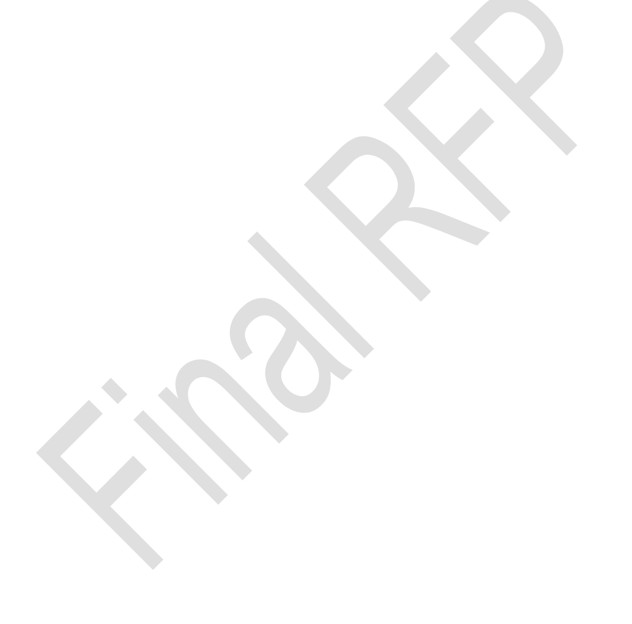
Page 7 of 141